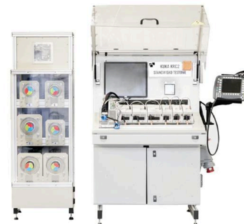
Test bench for KUKA KR C2